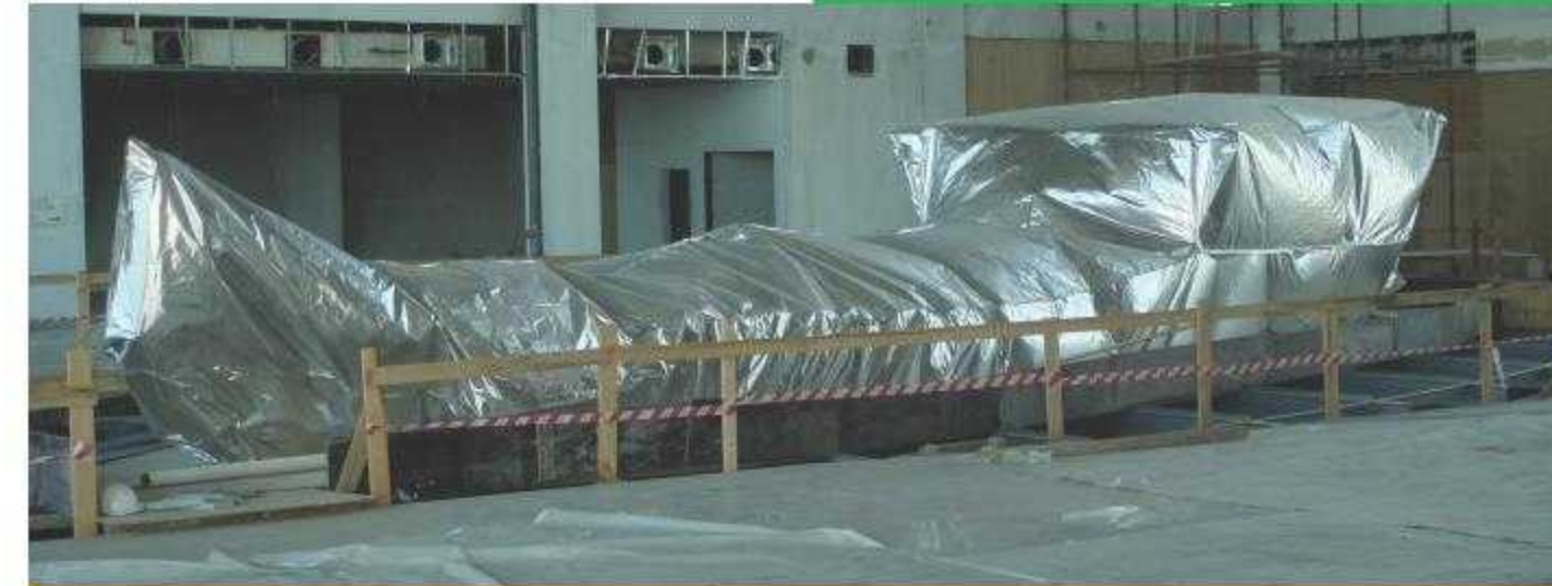
Treatment and Storage of Jalbut, Sharjah Maritime Museum, SHJ

After the treatment period, the art object can be stored in the treatment bag for long term preservation.